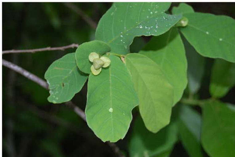
Friesodielsia obovata (Benth.) Verdc. Sofala province, Cherigoma plateau, along marked trail in Catapú; S 18°01', E 35°18'; alt 90 m