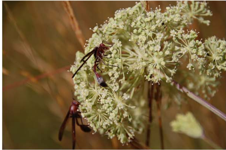
Diplophium buchananii (Benth. ex Oliv.) C. Norman Chimanimani mountains, in grassland (on schist) along Zomba trail between "Bakaromambo and middle reach of Muvumodzi", E 33.10854450, S 19.82197274; UTM36-WGS84 511367.037,7808215.342; alt 1400 m