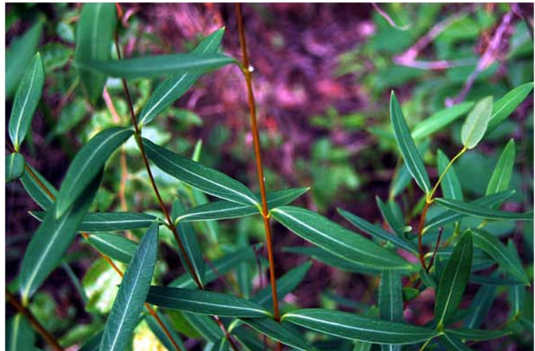
Cryptolepis sp. Chimanimani conservation area, miombo woodland vegetation in woodland close to the Mussapa pequeno river at the "portão"; E 33.08467816, S 19.58420245; UTM36-WGS84 508880.806,7834527.580; alt 600 m.