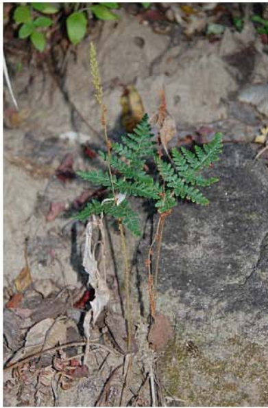
Anemia simii Tardieu Buffer zone of Chimanimani reserve, in and around Mahate camp; E 33.19065242, -19.67441750, alt 500 m.