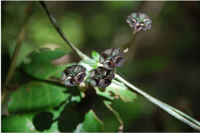
Ceropegia nilotica Kotschy Moribane forest, margin of Tava swamp; E 33.31817904, S 19.74685683; UTM36-WGS84 533336.205,7816499.845; 500 m