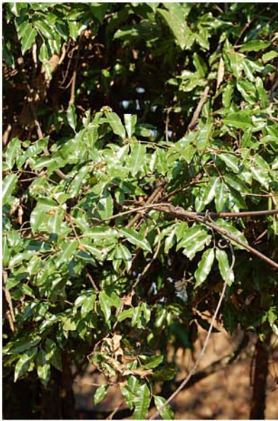
Landolphia kirkii Dyer ex Hook. f. Moribane forest, Mpunga camp, E 33.35557254, S 19.74402434; UTM36-WGS84 537254.686,7816805.502; alt 500 m