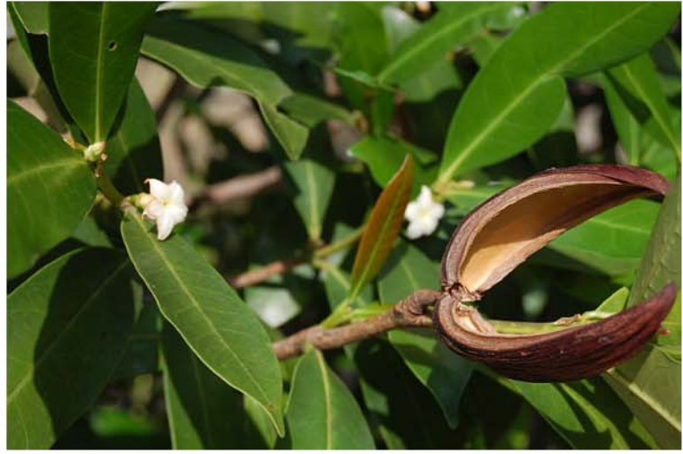
Mascarenhasia arborescens A. DC. Chimanimani mountains, in grassland above Chikukwa camp, along road close to Mussapa canyon; E 32.98493502, S 19.71489999, alt 1000 m.