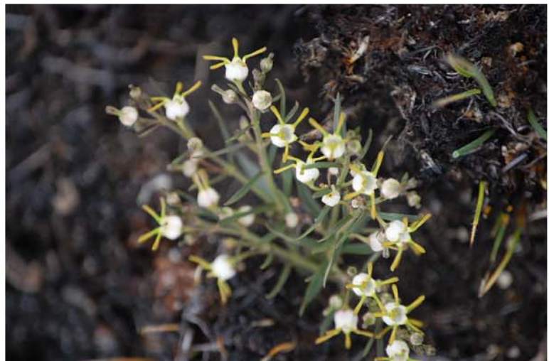
Brachystelma sp. Mt Tsetsera; rock places in grassland; E 32.84478451, S 19.39740637; UTM36-WGS84 483702.744,7855192.130; alt 2000 m.