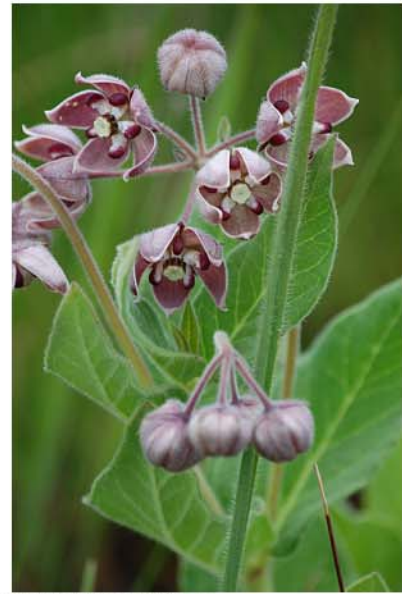
Trachycalymma fimbriatum (Weim.) Bullock Mt Tsetsera, grasslands towards the top of the plateau, E 32.79926601, S 19.38158055; UTM36-WGS84 478921.359,7856938.374; alt 2200 m