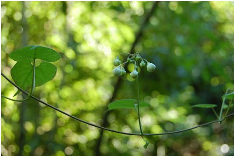
Pergularia daemia (Forssk.) Chiov. var. daemia Moribane forest, Mpunga camp, along path going to the river; E 33.35608683, S 19.74357478; UTM36-WGS84 537308.675,7816855.135; alt 500 m