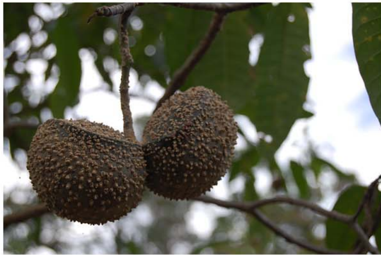
Tabernaemontana elegans Stapf Moribane forest, along "Picada da dona Candida"; E 33.33124050, S 19.73383349; UTM36-WGS84 534707.505,7817938.364; alt 600 m