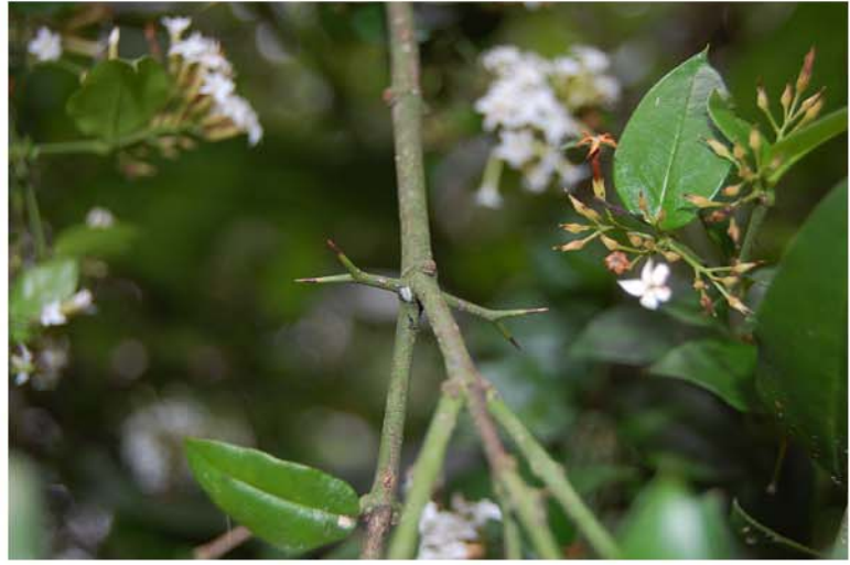
Carissa bispinosa (L.) Desf. ex Brenan Mt Tsetsera, undergrowth of mountain rainforest, E 32.83547724, S19.39908904; UTM36-WGS84 482725.678,7855005.032; alt 1900 m.