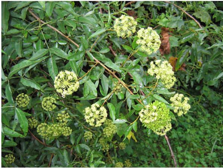
Heteromorpha arborescens (Spreng.) Cham. & Schildl. Mt Tsetsera in first small patch of mountain rainforest going up; E 32.84539515, S 19.37974687; UTM36-WGS84 483765.109,7857146.261; 1500 m