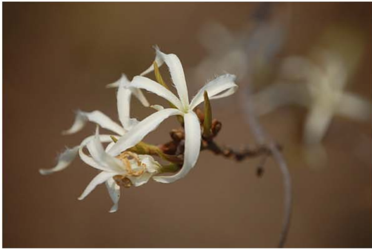
Ancylobotrys petersiana (Klotzsch) Pierre on gneiss inselberg in Zembe, 11 km from Chimoio to Sussundenga, E 33.39, S 19.22, alt 750 m