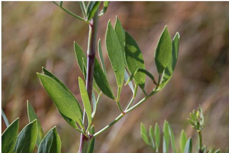
Diplophium buchananii (Benth. ex Oliv.) C. Norman Chimanimani mountains, in grassland (on schist) along Zomba trail between "Bakaromambo and middle reach of Muvumodzi", E 33.10854450, S 19.82197274; UTM36-WGS84 511367.037,7808215.342; alt 1400 m