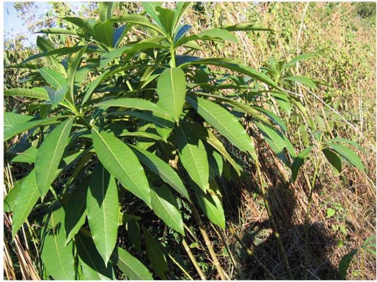
Rauvolfia caffra Sond. on track going up Mt Garuso, fallow fields/deforested area; E 33.16, S 18.97, alt 900 m