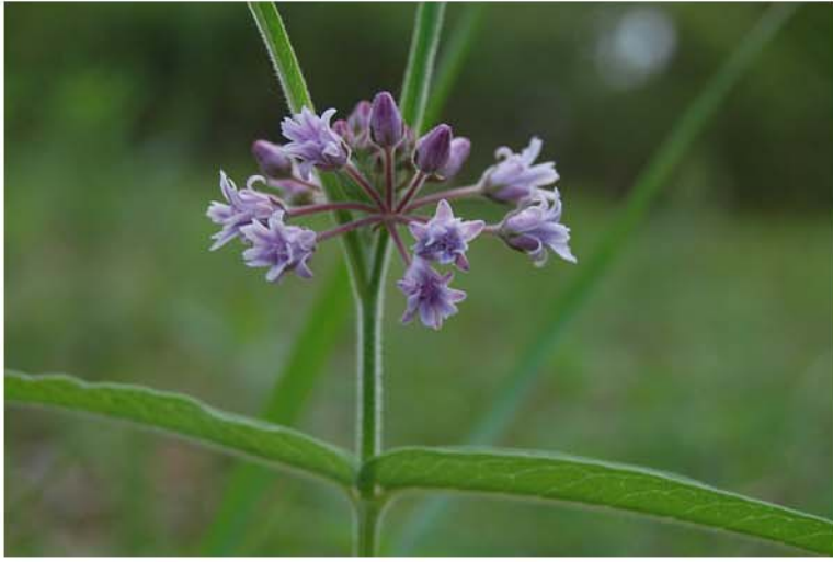
Margareta rosea Oliv. subsp. whytei (K. Schum.) M. Chimanimani mountains, in Chikukwa camp; E 32.97049649, S 19.71545629, alt 1000 m.