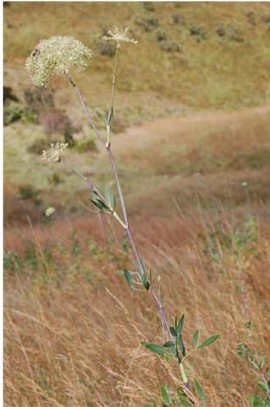
Diplophium buchananii (Benth. ex Oliv.) C. Norman Chimanimani mountains, in grassland (on schist) along Zomba trail between "Bakaromambo and middle reach of Muvumodzi", E 33.10854450, S 19.82197274; UTM36-WGS84 511367.037,7808215.342; alt 1400 m