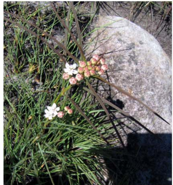
Asclepias cucullata (Schltr.) Schltr. subsp. scabrifolia (S. Moore) Goyder Chimanimani mountains, along path going up Mt Binga; E 33.08, S 19.77, alt 1900 m