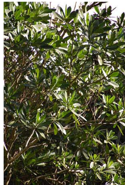
Voacanga thouarsii Roem. & Schult. Moribane forest, margin of Tava swamp, E 33.31593919, S 19.74784626; UTM36-WGS84 533101.327,7816390.795; 500 m