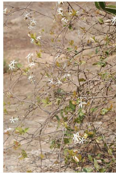
Ancylobotrys petersiana (Klotzsch) Pierre on gneiss inselberg in Zembe, 11 km from Chimoio to Sussundenga, E 33.39, S 19.22, alt 750 m