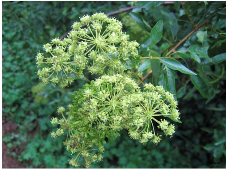
Heteromorpha arborescens (Spreng.) Cham. & Schildl. Mt Tsetsera in first small patch of mountain rainforest going up; E 32.84539515, S 19.37974687; UTM36-WGS84 483765.109,7857146.261; 1500 m