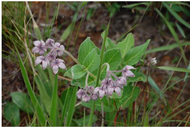
Trachycalymma fimbriatum (Weim.) Bullock Mt Tsetsera, grasslands towards the top of the plateau, E 32.79926601, S 19.38158055; UTM36-WGS84 478921.359,7856938.374; alt 2200 m