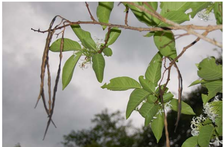
Holarrhena pubescens (Buch. - Ham.) Wall. ex G. Don Sofala province, Cherigoma plateau, along marked trail in Catapú; S 18°01', E 35°18'; alt 90 m