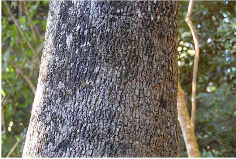
Rauvolfia caffra Sond. Moribane forest, toward end of "Picada da dona Candida"; E 33.31428353, S19.76096353; UTM36-WGS84 532925.169,7814939.584; alt 550 m