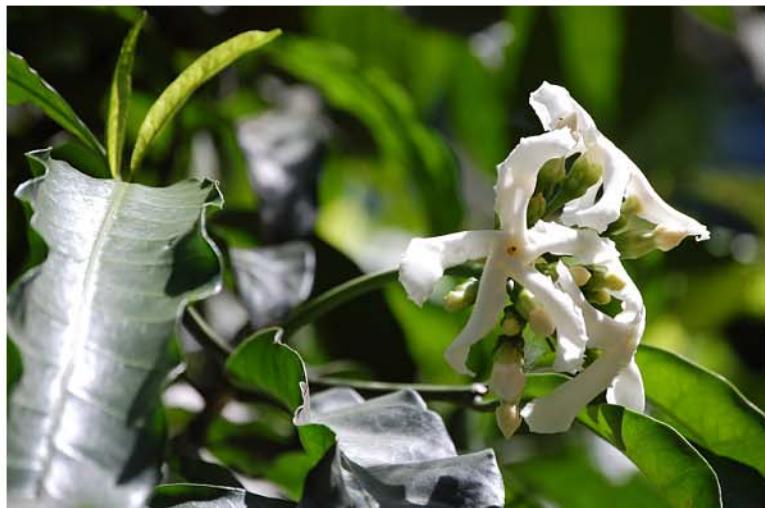
Tabernaemontana ventricosa Hochst. ex A. DC Moribane forest, Mpunga camp, E 33.35557254, S 19.74402434; UTM36-WGS84 537254.686,7816805.502; alt 500 m