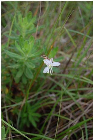
Chlorophytum galpinii (Baker) Kativu Mt Tsetsera, grassland, E 32.84062505, S 19.39909362; UTM36-WGS84 483266.182,7855005.032; alt 1950 m.