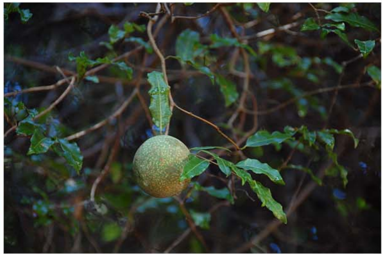
Landolphia kirkii Dyer ex Hook. f. Moribane forest, Mpunga camp; E 33.35608683, S 19.74357478; UTM36-WGS84 537308.675,7816855.135; alt 500 m