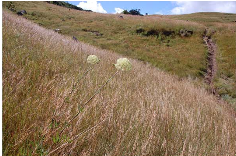
Diplophium buchananii (Benth. ex Oliv.) C. Norman Chimanimani mountains, in grassland (on schist) along Zomba trail between "Bakaromambo and middle reach of Muvumodzi", E 33.10854450, S 19.82197274; UTM36-WGS84 511367.037,7808215.342; alt 1400 m