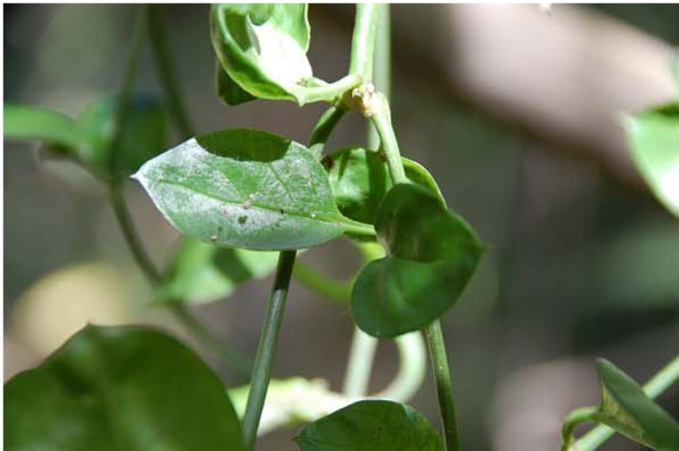
Ceropegia nilotica Kotschy Moribane forest, margin of Tava swamp; E 33.31817904, S 19.74685683; UTM36-WGS84 533336.205,7816499.845; 500 m