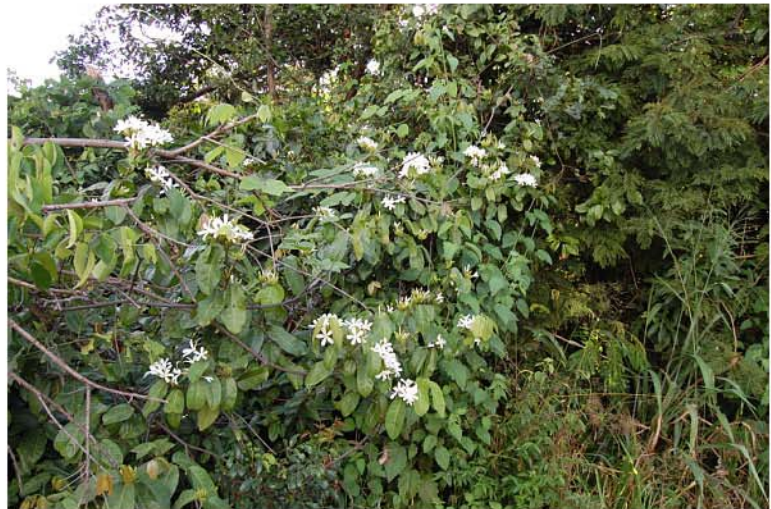
Saba comorensis (Bojer) Pichon var. comorensis Moribane forest along main road from Mpunga camp before Ponte de Deus; E 33.33463410, S 19.72958806; UTM36-WGS84 535064.017,7818407.458; alt 500 m