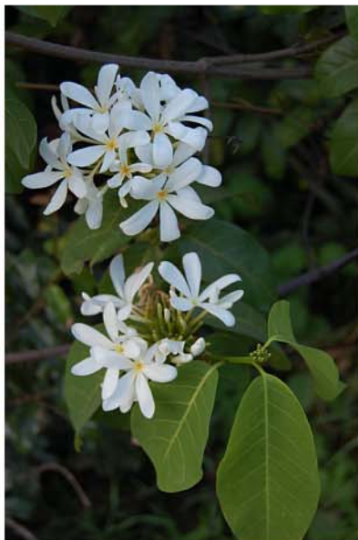
Saba comorensis (Bojer) Pichon var. comorensis Moribane forest along main road from Mpunga camp before Ponte de Deus; E 33.33463410, S 19.72958806; UTM36-WGS84 535064.017,7818407.458; alt 500 m