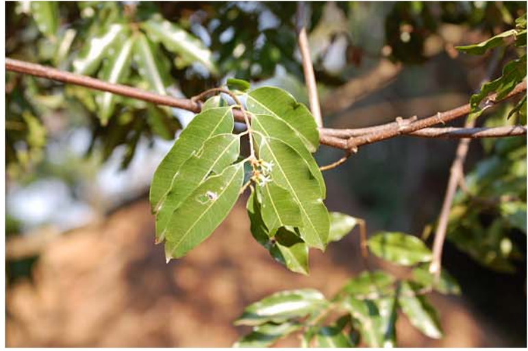
Landolphia kirkii Dyer ex Hook. f. Moribane forest, Mpunga camp, E 33.35557254, S 19.74402434; UTM36-WGS84 537254.686,7816805.502; alt 500 m