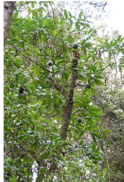
Tabernaemontana stapfiana Britten Chimanimani mountain range, in Gashwa mountain rainforest and canyon; E 33.08707851, S 19.83755290, alt 1450 m