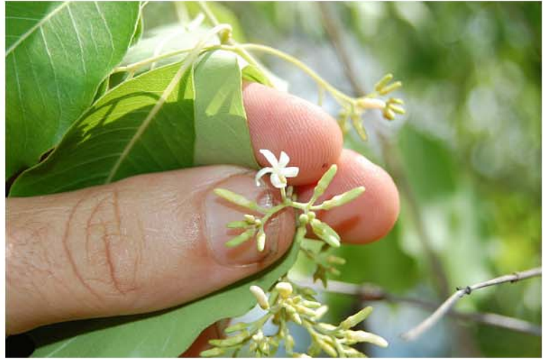
Diplorhynchus condylocarpon (Müll. Arg.) Pichon Chimanimani conservation area, miombo woodland vegetation in woodland close to the Mussapa pequeno river at the "portão"; E 33.08467816, S 19.58420245; UTM36-WGS84 508880.806,7834527.580; alt 600 m.