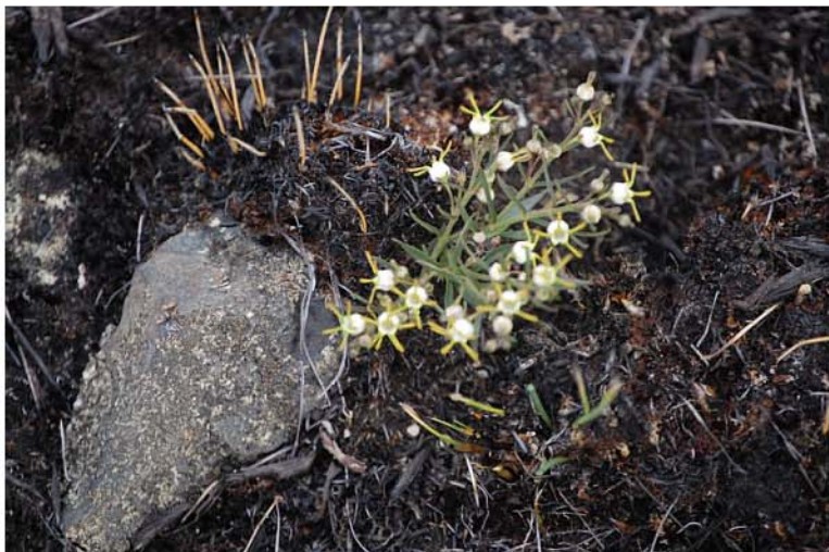
Brachystelma sp. Mt Tsetsera; rock places in grassland; E 32.84478451, S 19.39740637; UTM36-WGS84 483702.744,7855192.130; alt 2000 m.