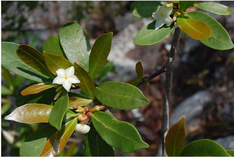
Mascarenhasia arborescens A. DC. Chimanimani mountains, in grassland above Chikukwa camp, along road close to Mussapa canyon; E 32.98493502, S 19.71489999, alt 1000 m.