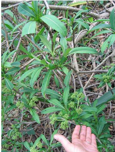
Rauvolfia caffra Sond. Moribane forest