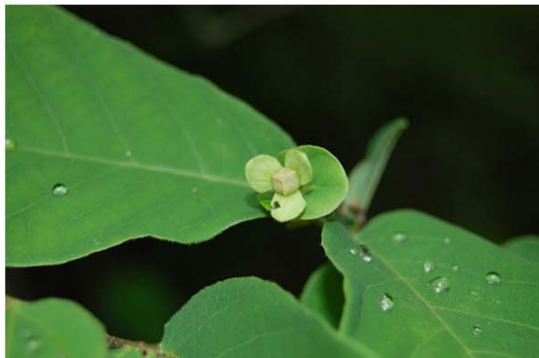
Friesodielsia obovata (Benth.) Verdc. Sofala province, Cherigoma plateau, along marked trail in Catapú; S 18°01', E 35°18'; alt 90 m