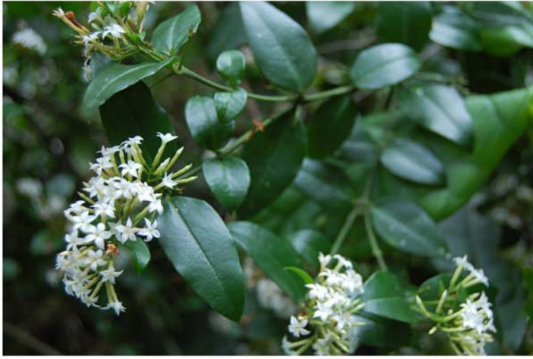
Carissa bispinosa (L.) Desf. ex Brenan Mt Tsetsera, undergrowth of mountain rainforest, E 32.83547724, S19.39908904; UTM36-WGS84 482725.678,7855005.032; alt 1900 m.