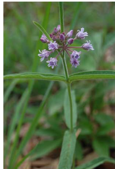
Margaretta rosea Oliv. subsp. whytei (K. Schum.) M. Chimanimani mountains, in Chikukwa camp; E 32.97049649, S 19.71545629, alt 1000 m.