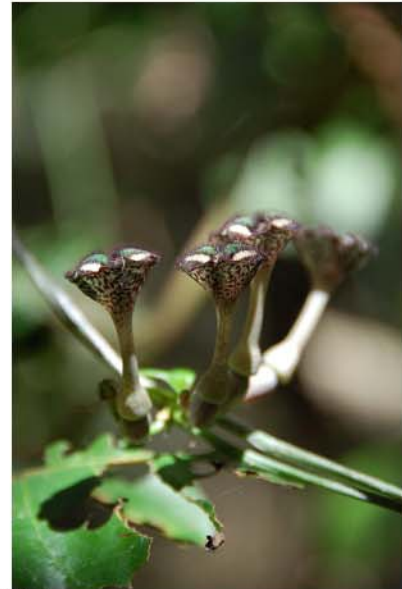
Ceropegia nilotica Kotschy Moribane forest, margin of Tava swamp; E 33.31817904, S 19.74685683; UTM36-WGS84 533336.205,7816499.845; 500 m